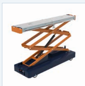
Benomic scissor lift trolley